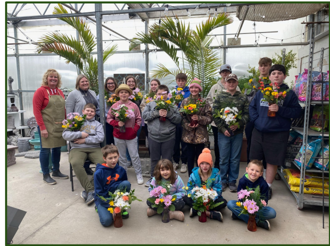
Best of Union Members were hosted by Harvey's Greenhouse in March and tried their hands at floral arranging.

Next Meeting – April 14 th 2-4 pm Location: TBD